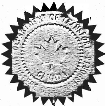
Sorin Camer For Minister of Transport

Conditions: This approval is only applicable to the type/model of aeronautical product specified therein. Prior to incorporating this modification, the installer shall establish that the interrelationship between this change and any other modification(s) incorporated will not adversely affect the airworthiness of the modified product.